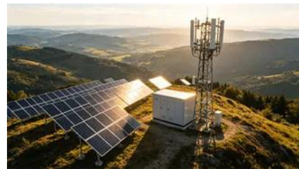
ABB central inverters PVS800 - 500 to 1000

It is a monolithic, IGBT-based three level inverter with 1 MPPT tracker and 6 DC inputs. Key specifications include a 1000kVA nominal power rating at 50C, 98.8% maximum efficiency, IP56/66