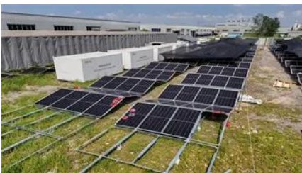
ABB central inverters

ABB's transformerless central inverter series enables system integrators to design the PV power plant using optimum combination of different power rating inverters.