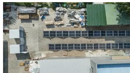
ABB central inverters PVS980 - 1818 to 2091 k

The PVS-100/120-TL is ABB's cloud connected three-phase string solution for cost efficient decentralized photovoltaic systems for both ground mounted and large commercial applications.